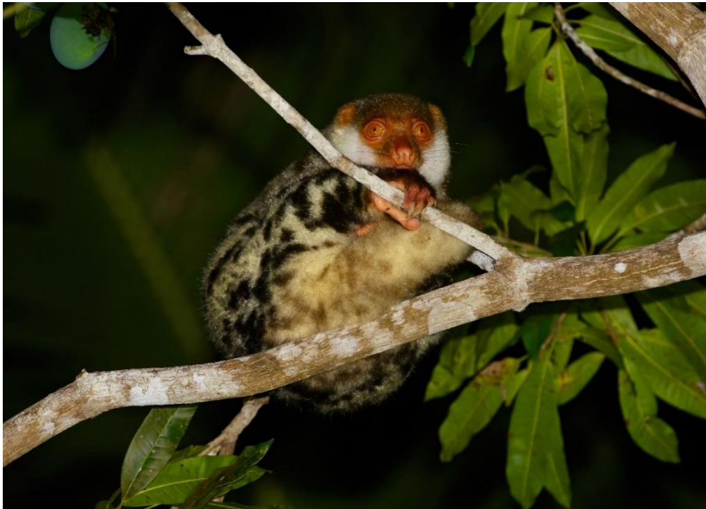
Waigeo Cuscus