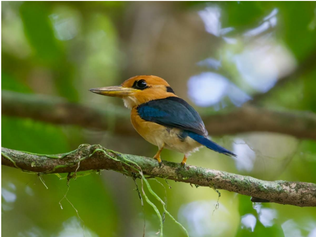
Yellow-billed Kingfisher

July 3-4, Days 13-14: Waigeo. Whilst most visitors to Raja Ampat head to the beaches and diving sites, we should have the forest to ourselves and over the next two days will have several opportunities to search for the island’s star attractions. Wilsons Bird-of-Paradise will be a priority. Variously described as the best or most beautiful bird in the world, it is certainly one of the strangest – the adult male presenting a combination of electric blue cap, deep red and black mantle, and curiously curled, antennae-like tail plumes. We have a very good chance to observe the bizarre courtship ritual at eye-level, from the comfort of a specially constructed hide. We will also try our luck at the ‘dancing tree’ of the Red Bird-of-Paradise and visit some different forest areas that should