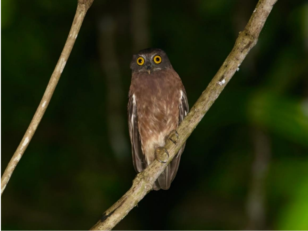
Papuan Boobook