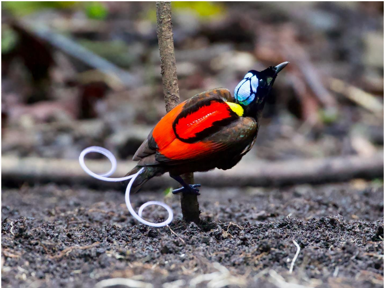
Wilson's Bird-of-Paradise