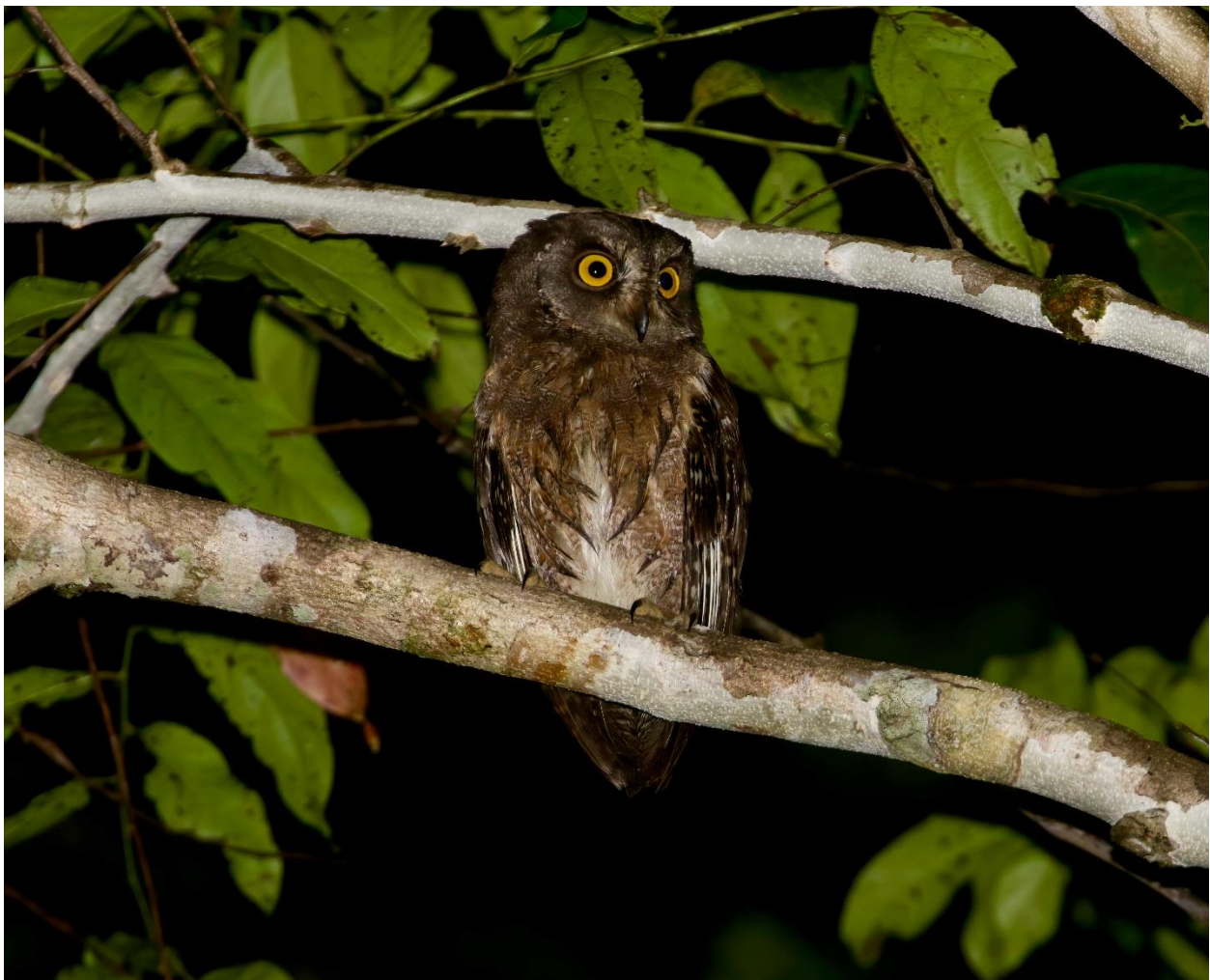
Biak Scops Owl © Scott Baker